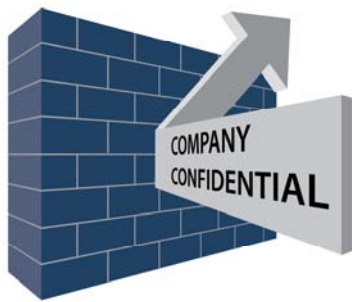
Figure 1: Allows you to classify, control and manage applications and data that pass through the firewall.

With an Application Firewall, administrators can define custom access controls based upon user, application, schedule or IP subnet level. As a result, administrators gain the ability to truly manage the full range of applications that are available for access. Specifically, they can enforce approved application use and maintain control over P2P applications.